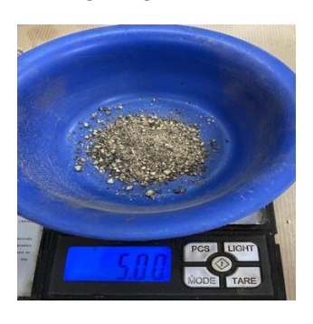
Fig 8. Maricha