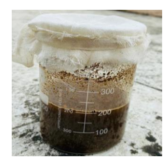
Fig 12. Dry ingredients soaked in Nimbu swarasa