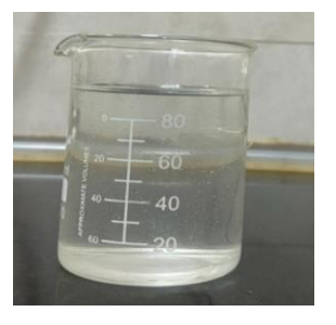
Fig 14. Arka obtaine