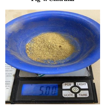
Fig 7. Haritaki