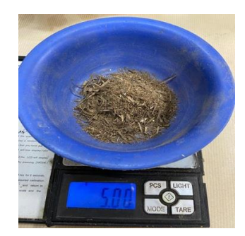
Fig 3. Chavya