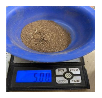
Fig 4. Chitraka