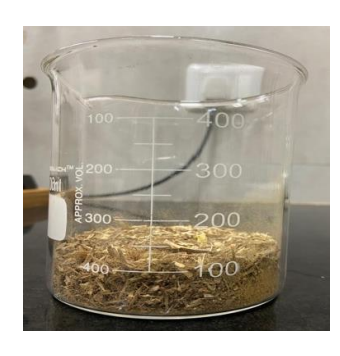
Fig 9. Dry ingredients