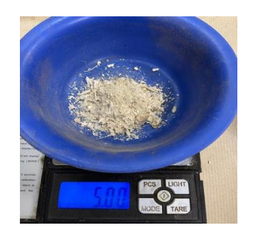
Fig 5. Nagara/Shunti