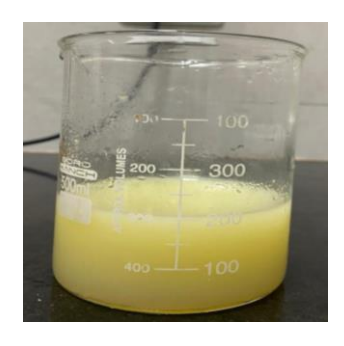
Fig 10. Nimbu swarasa