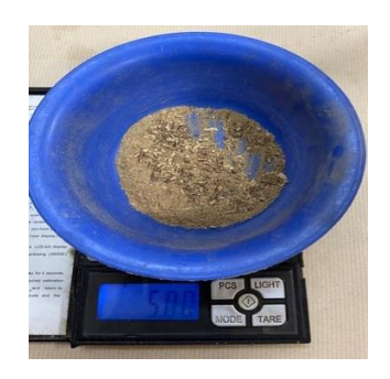
Fig 2. Pippali mula