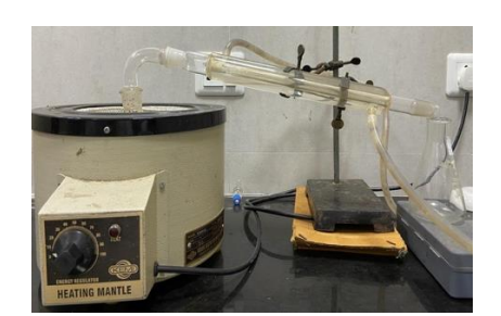
Fig 13. Distillation process