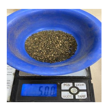
Fig 1. Pippali